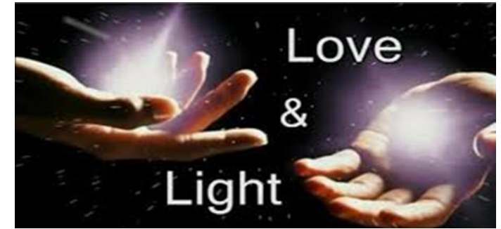
St John Church of Christ A Family of God

St John Church of Christ 609 N Pearl P. O. Box 241 St John, KS 67576